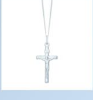
Compulsory religious jewellery