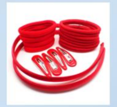
Red, black. White or grey simple hair accessories